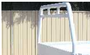
Rear Loading Rack