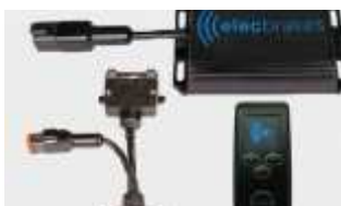
Bluetooth brake controller