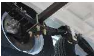
Upgraded suspension to 4.5 tonne