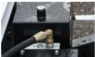
12 volt Tipping unit upgrade