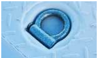
Flush Mount Tie-down points