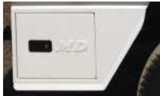
Under Tray Toolbox