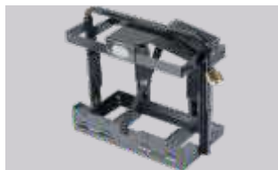
Jerry Can Holder