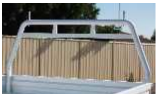
Rear builders rack