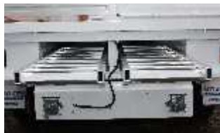
Underfloor Ramp Provisions