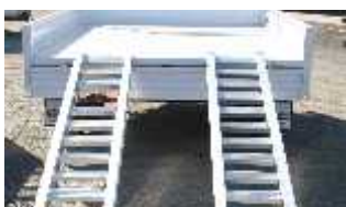
Aluminium Loading Ramp