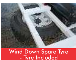
Wind Down Spare Tyre - Tyre Included