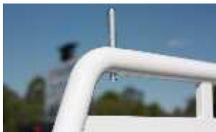
Load restraint pins