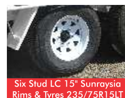
Six Stud LC 15" Sunraysia Rims & Tyres 235/75R15LT