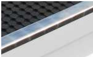
Stainless Steel Capping