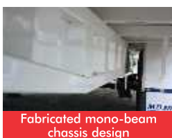
Fabricated mono-beam chassis design