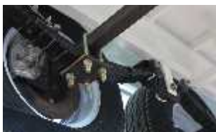
Upgraded suspension to 4.5 tonne