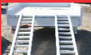
Aluminium Loading Ramp