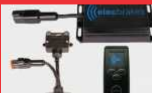
Bluetooth brake controller