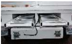
Underfloor Ramp Provisions