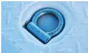
Flush Mount Tie-down points