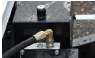
12 volt Tipping unit upgrade