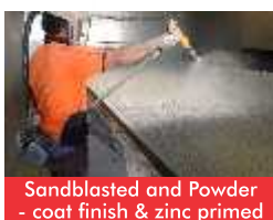
Sandblasted and Powder - coat finish & zinc primed