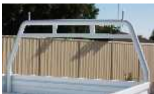
Rear builders rack