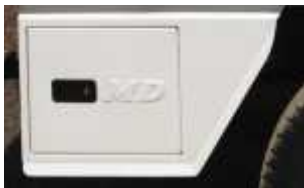
Under Tray Toolbox