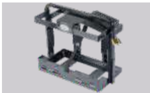
Jerry Can Holder