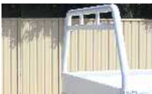
Rear Loading Rack