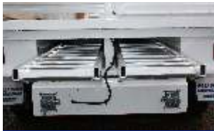
Underfloor Ramp Provisions