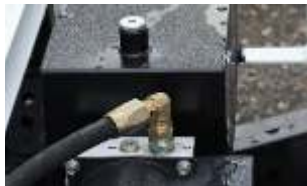
12 volt Tipping unit upgrade