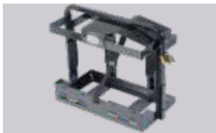
Jerry Can Holder