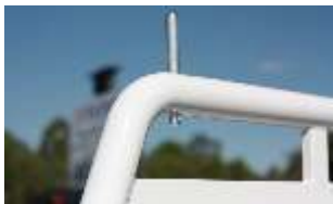
Load restraint pins