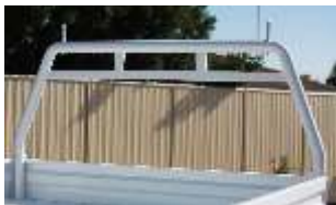
Rear builders rack