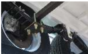
Upgraded suspension to 4.5 tonne