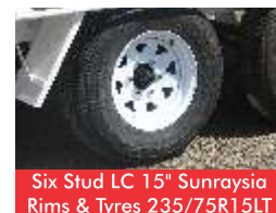
Six Stud LC 15" Sunraysia Rims & Tyres 235/75R15LT