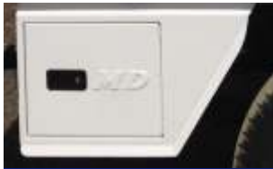
Under Tray Toolbox