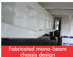
Fabricated mono-beam chassis design