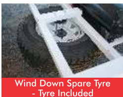
Wind Down Spare Tyre - Tyre Included