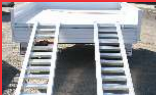
Aluminium Loading Ramp