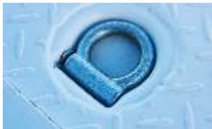
Flush Mount Tie-down points