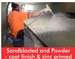
Sandblasted and Powder - coat finish & zinc primed