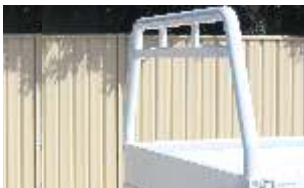
Rear Loading Rack