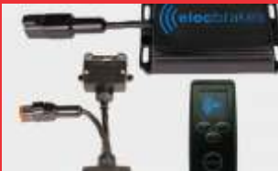
Bluetooth brake controller