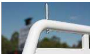
Load restraint pins