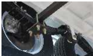
Upgraded suspension to 4.5 tonne