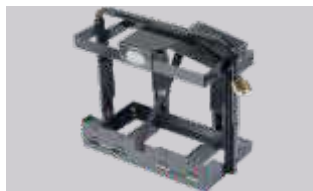
Jerry Can Holder