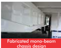
Fabricated mono-beam chassis design