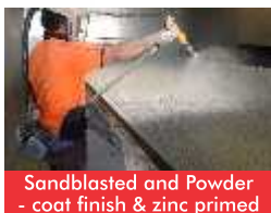
Sandblasted and Powder - coat finish & zinc primed