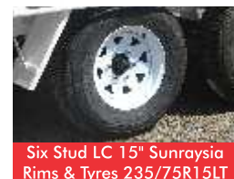
Six Stud LC 15" Sunraysia Rims & Tyres 235/75R15LT