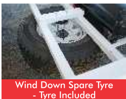
Wind Down Spare Tyre - Tyre Included