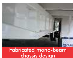
Fabricated mono-beam chassis design