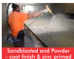
Sandblasted and Powder - coat finish & zinc primed