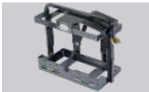
Jerry Can Holder