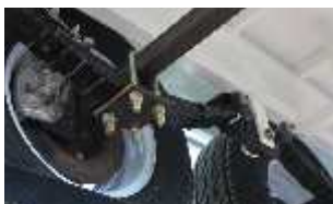
Upgraded suspension to 4.5 tonne